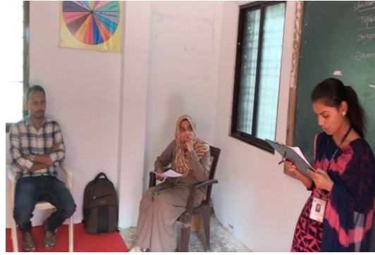
Students observing Happy Prince