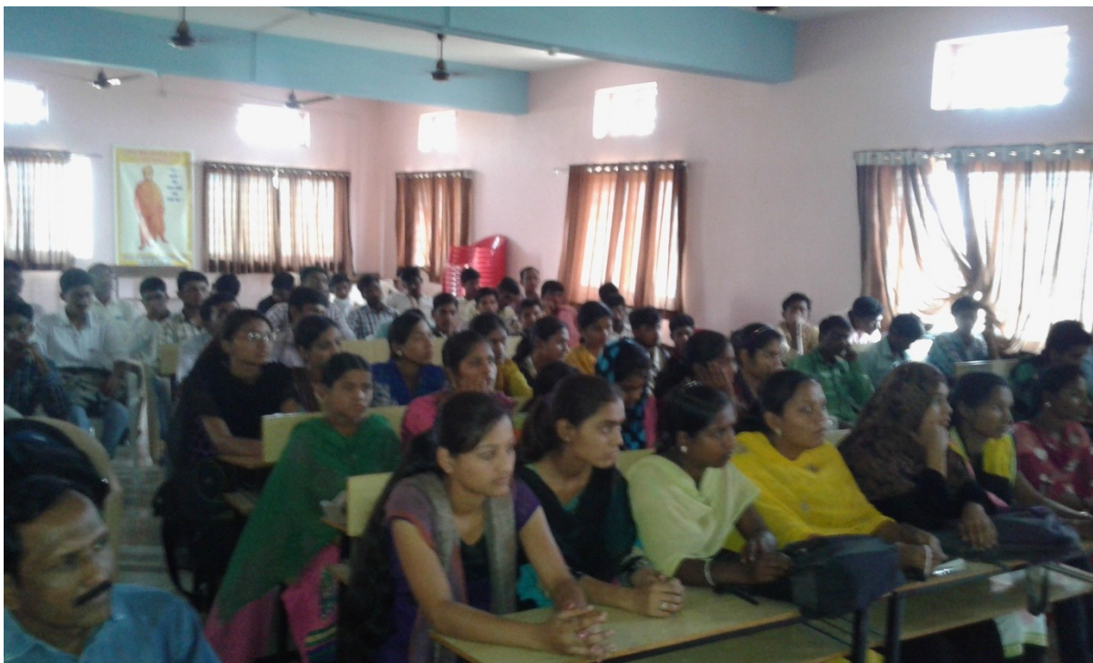
The students of the college