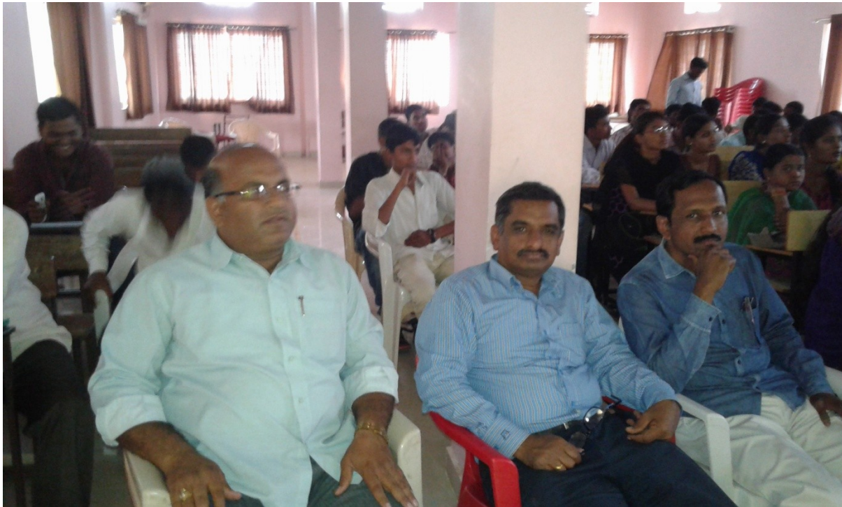
The staff and the students observing video show