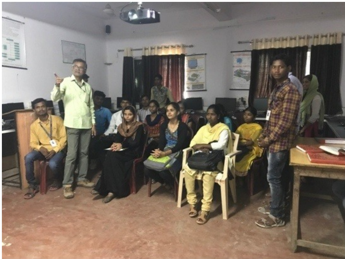
The students busy in watching communication activities on screen