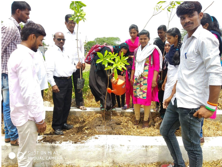
Tree Plantation in College Campus